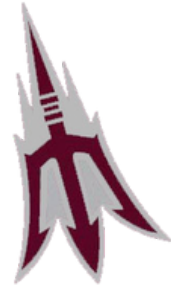
Mason Middle School