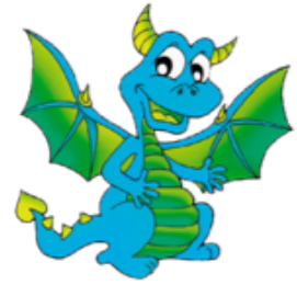
Donelson Hills Elementary